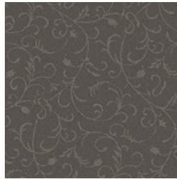
Carolina - 11371