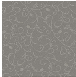
Carolina - 11370