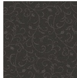
Carolina - 11376