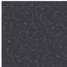
Carolina - 11374