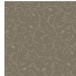
Carolina - 11395