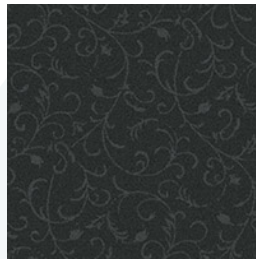
Carolina - 11375